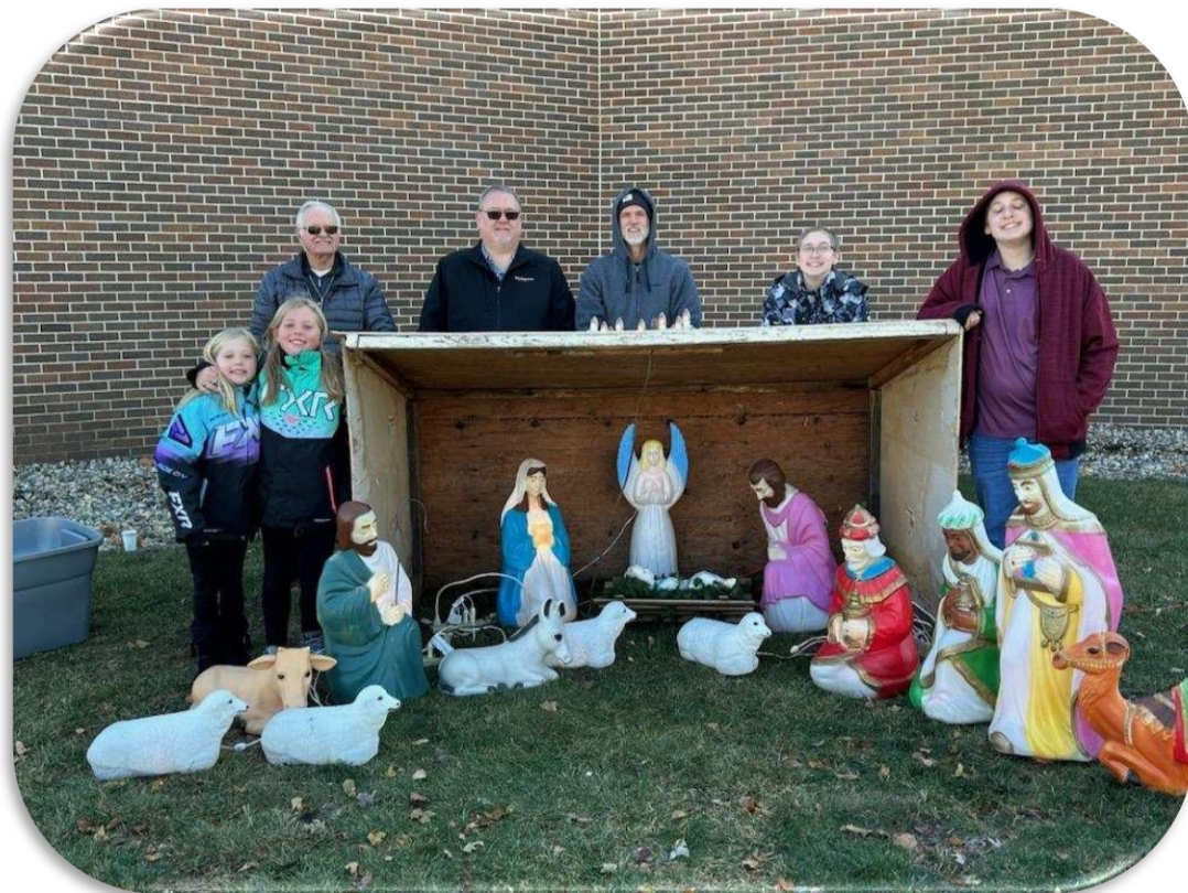
Setting up the Nativity